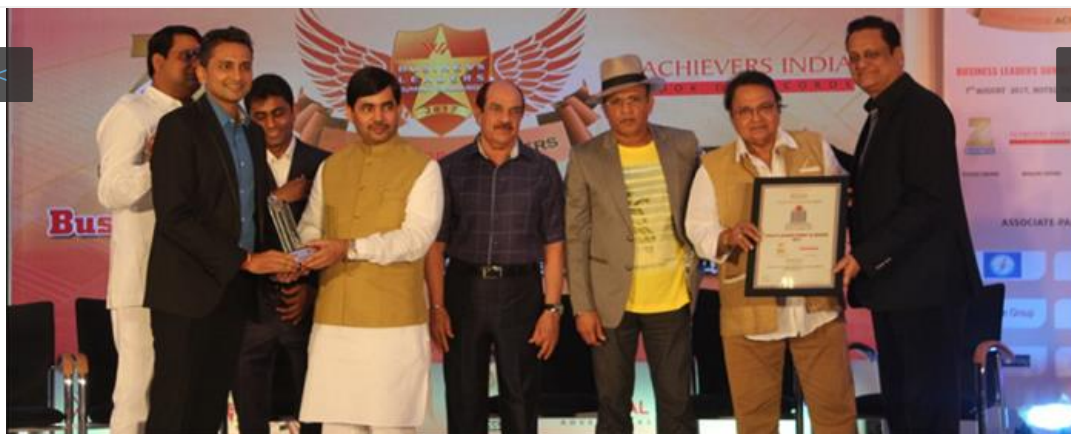
Nirvana Realty honored with The 7th Realty Leader Award

Nirvana Realty one of the leading developer in Maharashtra's weekend home market has bagged the 'The Best Luxury Developer of Weekend Homes in Maharashtra' award at the 7th Edition of the Realty Summit and Award 2017.